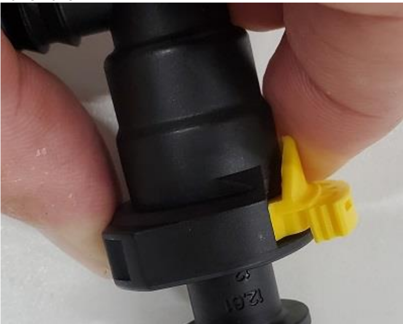
Tab Unlocked, Button pressed to release

TIP: The quick connections are all adjustable in the end of the hoses, if the fitting isn't at an optimum angle, twist the fitting until it is. The hoses can also twist on the J&L Oil separator connections for adjustment, use the natural bend of the hoses to your advantage.